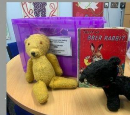
Y1 1960's Topic. Enhanced by the Loan Box service.

A highlight of our history curriculum is History Week, an annual event designed to deepen students understanding and engagement with key historical themes, such as the rich, local history of Rainhill and the significant events of World War II. Held during the Autumn term, students took part in a range of activities, including visits to local heritage sites, which brought history to life.