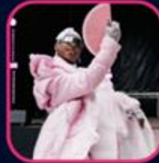
Family Catwalk Extravaganza