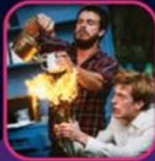
The Most Dangerous Cup of Tea in the World