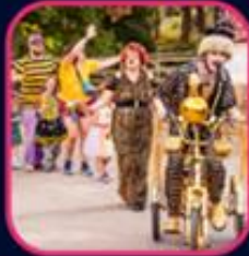
Big Gay Disco Bike