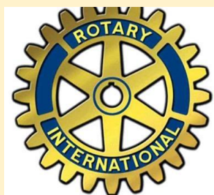
Rainhill Rotary Club

Whole school assessment week will take place week commencing Monday 21 st June. In order to support your child, please ensure they get plenty of rest after school, go to bed at an age appropriate time and they are off any devices at least one hour before bedtime. The outcome of assessment week will be shared with parents/ carers at Mentoring Conversations and in the end of year school report.