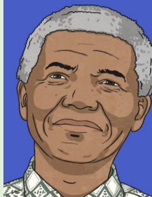
Nelson Mandela 1918 - 2013

"Education is the most powerful weapon which you can use to change the world."